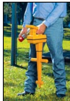
3M™ Dynatel™ Cable/Pipe Locator 2250M

* When connected to standard NMEA compliant GPS devices.