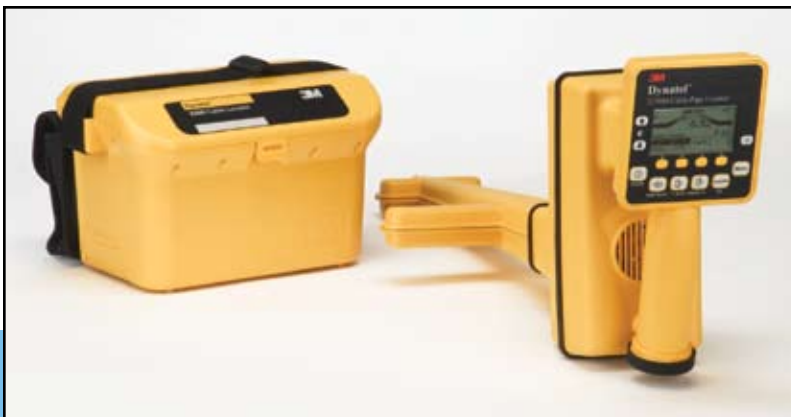
3M™ Dynatel™ Cable/Pipe Locator 2250M